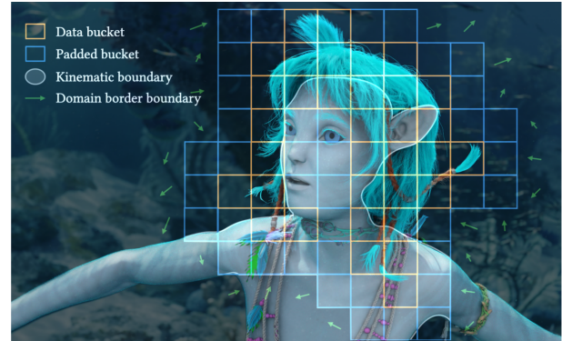
Figure 3: Schematic view of how fluid voxels are allocated sparsely around elastic objects.

This frees the users from dealing with the Behavior hierarchy and allows the developers to continuously extend the tools on the leaf level without touching other parts of the tree.