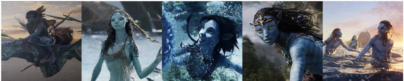
Figure 1: With one Solver Setup, we simulated every hero character’s costume coupled with various surrounding environments.